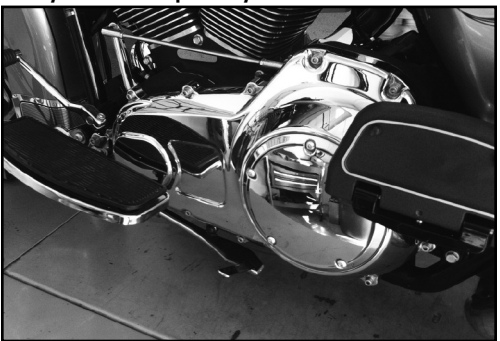
NOTE: At some point in time you will have chain 'stretch' and will need to add an additional shim. Save your extra shims and instruction sheet for future use. Please call us if you need replacements.

Re-assemble the engine's primary case and add fluid as recommended by Harley Davidson. We suggest that you replace the gaskets, if necessary (usually your original gasket can be used again without leaks). Check the unit for wear every 20,000 miles depending on your riding style...and always use clean primary fluid.